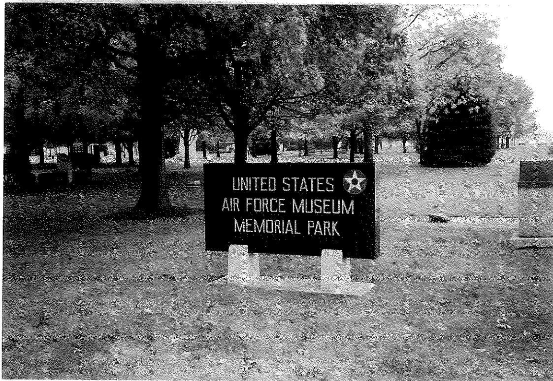
NATIONAL MUSEUM OF THE USAF - Pictures Taken July 2004