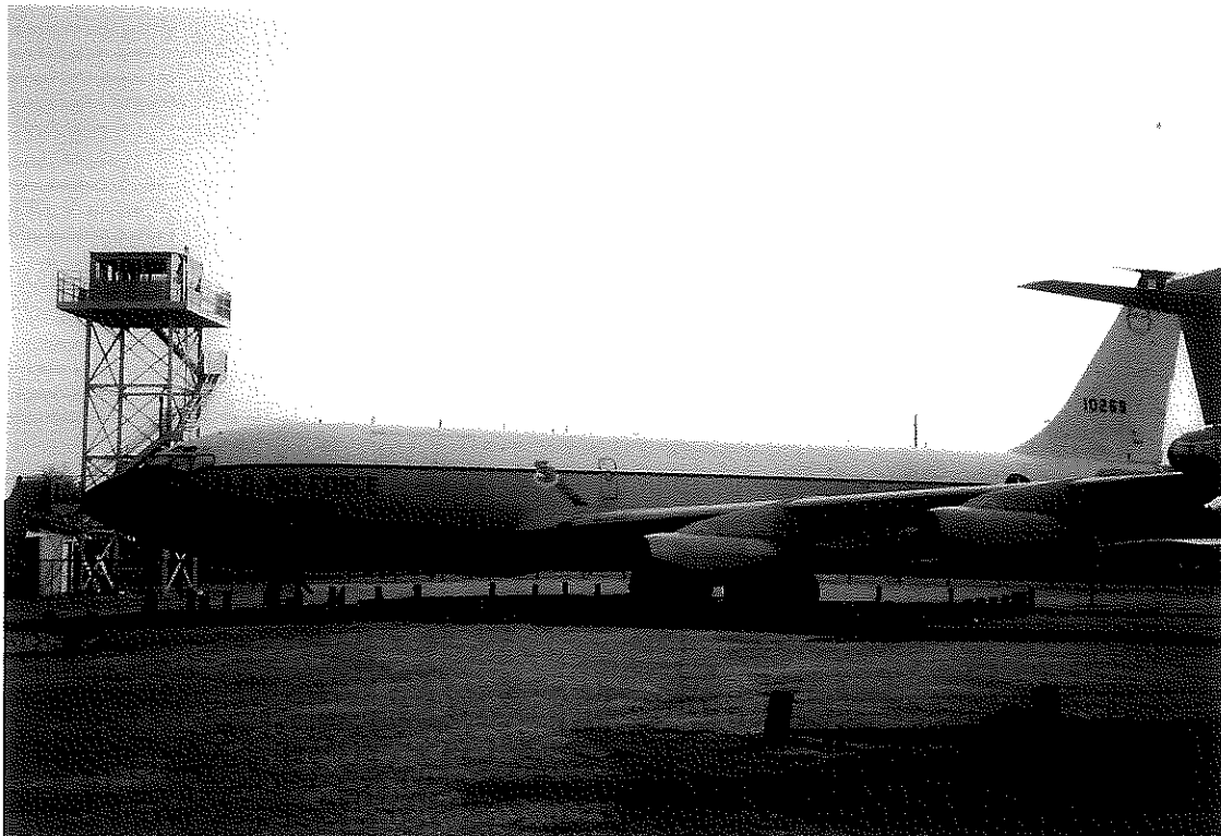
EC-135L, 61-0269 - Grissom Air Museum, Indiana - July 2003